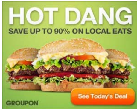
www.Groupon.com/Portland Arts by Google

Tags: U.S. Navy , coastal protection , weapons testing , environmental impact , action alert (all tags) :: Previous Tag Versions