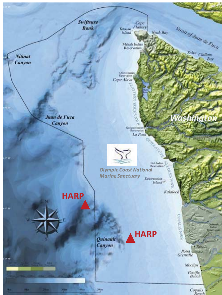
Figure 13-1. Location of Navy funded HARPs deployed in January and May 2011 in relationship to Olympic Coast National Marine Sanctuary and associated bathymetry. (Underlying graphic from NOAA Olympic Coast National Marine Sanctuary)

Also within this reporting period (12 Nov 2010 to 01 May 2011), the Navy purchased 10 satellite tracking tags suitable for deployment on a suite of marine species within the Northwest Training Range Complex. Two tag types are on order: