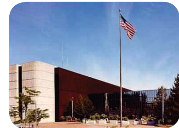
Trident Training Facility at Naval Base Kitsap Bangor.