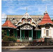
In Trinidad, a Painted Lady in Distress