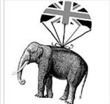
Op-Ed: An English Lesson for Republicans