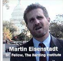
A Senior Fellow at the Institute of Nonexistence