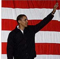
Loosening His Tie (Sort Of)