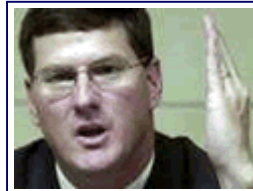
Former UN Weapons Inspector Scott Ritter.

Nov. 14 (AP) — Former United Nations weapons inspector Scott Ritter says the U.N. resolution to disarm Iraq makes war inevitable.