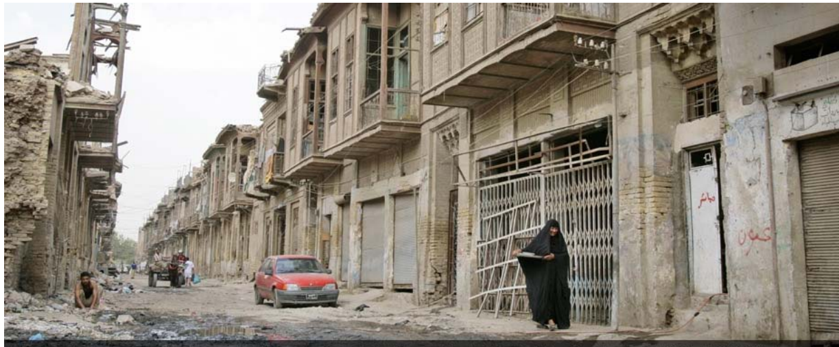
An elderly Iraqi woman carries dishes past old houses in a formerly Jewish area of central Baghdad, Iraq, Monday, Aug. 25, 2008.