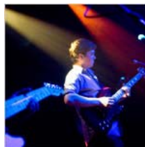
Band Between Buzz and Big Break at SXSW