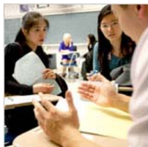
At Stuyvesant, Parent-Teacher-Translator Night