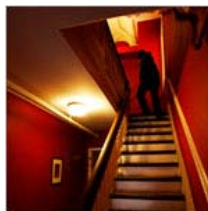
The Walk-Up Advantage