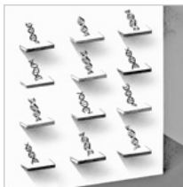
Letters: Create a National DNA Database?