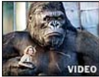
Movie Minutes: 'King Kong'