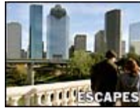
36 Hours in Houston