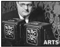
Rescuing the Met's Archives