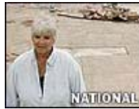
A Conflict Over How to Rebuild