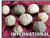
Ancient Battlefield Discovered