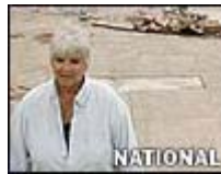
A Conflict Over How to Rebuild