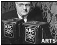
Rescuing the Met's Archives