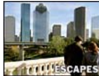
36 Hours in Houston