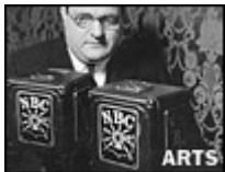
Rescuing the Met's Archives