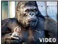
Movie Minutes: 'King Kong'