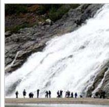
36 Hours in Juneau, Alaska