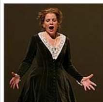
It's Not Over Till the HD Video Is Screened