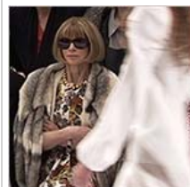
The Cameras Zoom In on Fashion's Empress