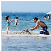
Up to the Sea Again, to Ride a Kayak, or a Porch