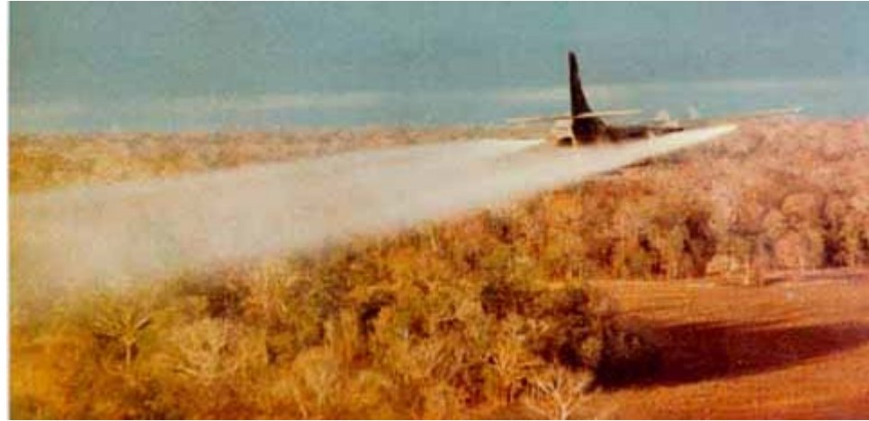
UC-123 aircraft on Operation Ranch Hand spray mission

"The term Operation Ranch Hand was the military code name for the spraying of herbicides from U.S. Air Force aircraft in Southeast Asia from 1962 through 1971."